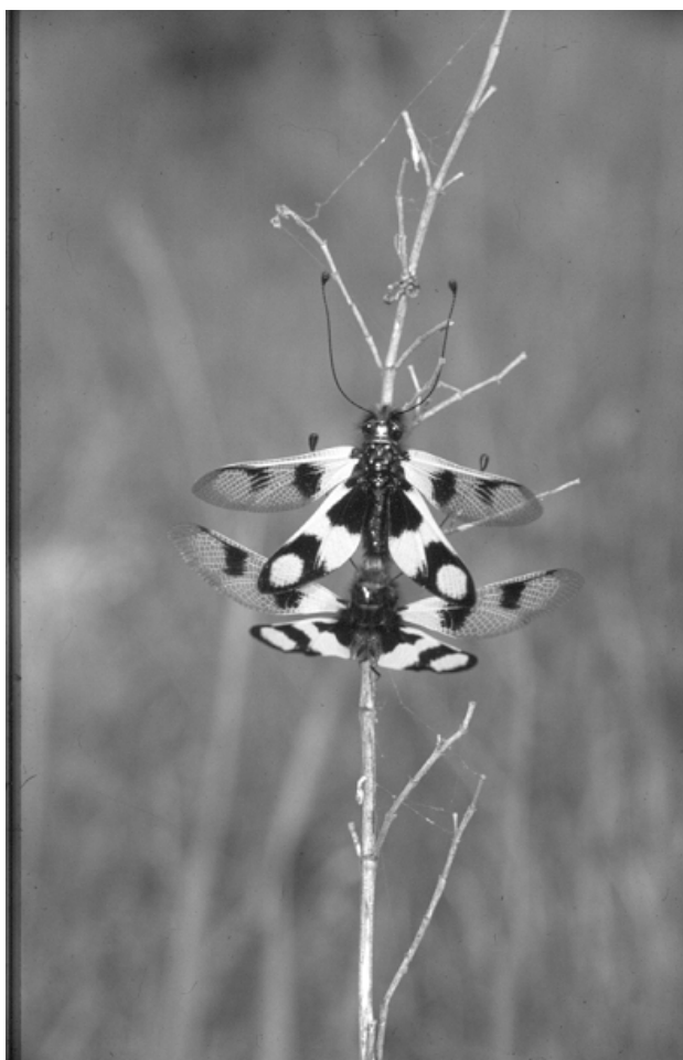
Fig. 2: Owl-fly Libelloides macaronius (Scopoli, 1763) in copula.

Ankaran, 27.-29. VII. 1982 (MZ); Bela krajina: Darnj, 4. VII. 1980 (DD); Bela krajina: Vinica, 5. VII. 1980 (DD); Cerknica, Menišija, 10. VII. 1966 (JC);